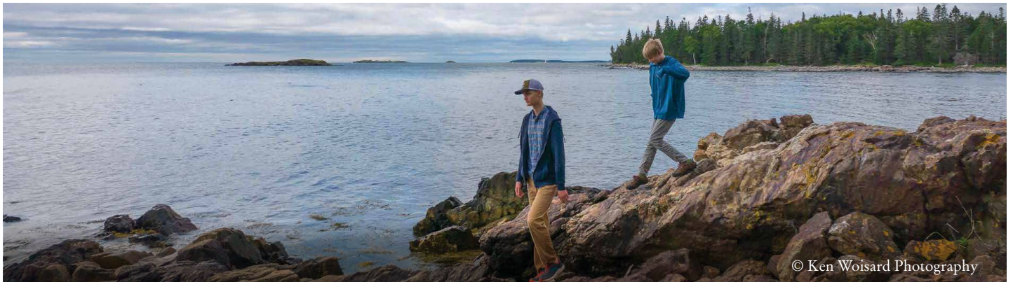
Visitors enjoy exploring the rocky shoreline of Sheep Island.

Sheep Island is easy to get to. Not far from the mainland, boaters can pull small craft right up to the beach. It's not far from Ash Island, which has been an MCHT preserve since 2010, and Monroe Island, which MCHT acquired for public access in 2018. Around that time, MCHT worked with the town of Owls Head to create a public park at Owls Head Harbor with much-needed parking and improved water access for commercial fishermen and recreational boaters.