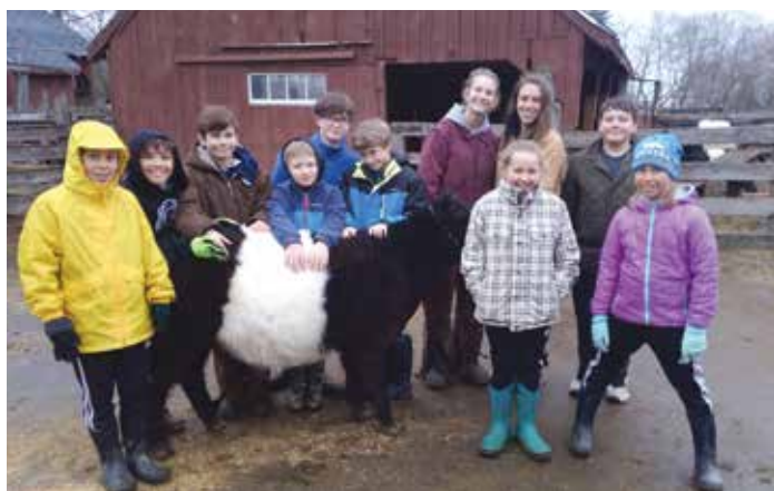
A group of Farm Hands from a session in the early spring of 2017.