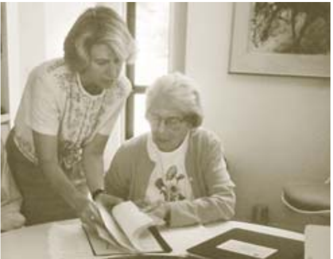
The signing of an easement marks the culmination of the planning and negotiating process.

For more detail on the steps involved in granting an easement, contact Maine Coast Heritage Trust for a copy of Technical Bulletin #108, “The Conservation Easement from Start to Finish: An Overview for Landowners.”