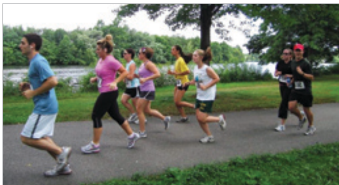
RUNNERS ENJOY THE 2009 CAPE SHORE FOUNDATION 5K.

Cape Shore Foundation, a nonprofit charitable trust established in 2007, held a 5K road race in Brighton, Massachusetts, late in August and generously donated all the race proceeds to Maine Coast Heritage Trust. Formed by four friends in their late 20s who grew up together in Cape Elizabeth, the foundation is "committed to preserving the natural habitats of New England, from the reaches of the Great North Woods to the fisheries of Narragansett Bay." The Trustees seek to sustain the region's beauty and integrity, recognizing that they