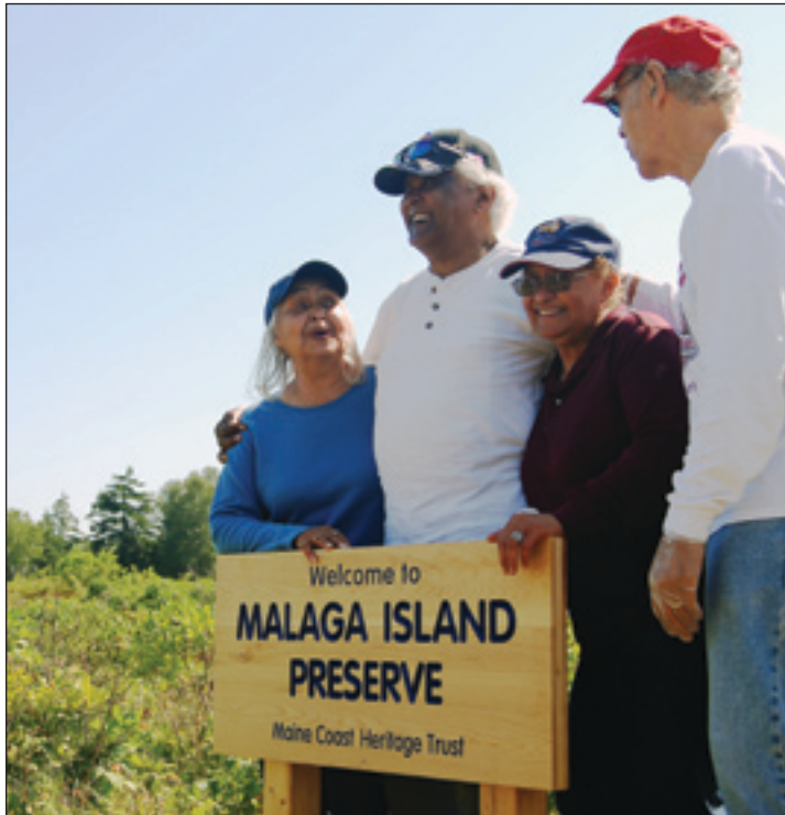
FRIENDS CELEBRATE THE NEW MAINE FREEDOM TRAIL SITE AT MCHT'S MALAGA ISLAND PRESERVE IN CASCO BAY.

In partnership with the nonprofit organization Maine Freedom Trails, Inc., Maine Coast Heritage Trust hosted a ceremony in August dedicating its Malaga Island Preserve in eastern Casco Bay as a Maine Freedom Trail site. The 42-acre Malaga Island was home to a mixed-race community for more than three decades before the State of Maine forcibly removed residents in 1912 due to racial prejudice and other pressures. Maine Coast Heritage Trust was able to acquire the entire island in 2001, thanks to the generosity of the previous landowner.