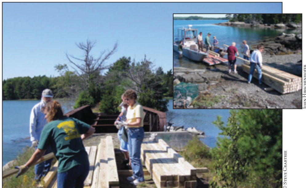
MCHT PARTICIPATED IN A BROAD-BASED COMMUNITY PARTNERSHIP IN THE TOWN OF HANCOCK THAT HAS COMPLETED SEVERAL CONSERVATION PROJECTS ALONG THE UPPER SKILLINGS RIVER. AS PART OF THIS EFFORT, AREA RESIDENTS WORKED TO CREATE A 3-MILE RECREATIONAL PATHWAY ALONG A FORMER RAIL BED.

What's most remarkable about the cooperation and creativity evident in these projects is that they're not exceptions to the rule. Most of MCHT's conservation projects involve visionary landowners and collaborators giving their best efforts to the task. These partners are what make each Whole Place, and each completed project, so much greater than the sum of the parts.